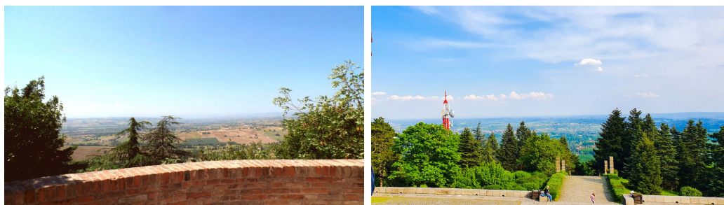
FIGURE 1. View from the Colle Dell'Infinito, Recanati, Italy (left) [17], view from Mountain Avala, Belgrade, Serbia

of the new condition (So between this/Immensity drowns my thought:/And shipwreck is sweet to me in this sea). Recurrence of the initial composed rhythm produces a sensation of closure and circularity (Always dear was to me this solitary hill/And shipwreck is sweet to me in this sea), introducing a parallelism between space and time.